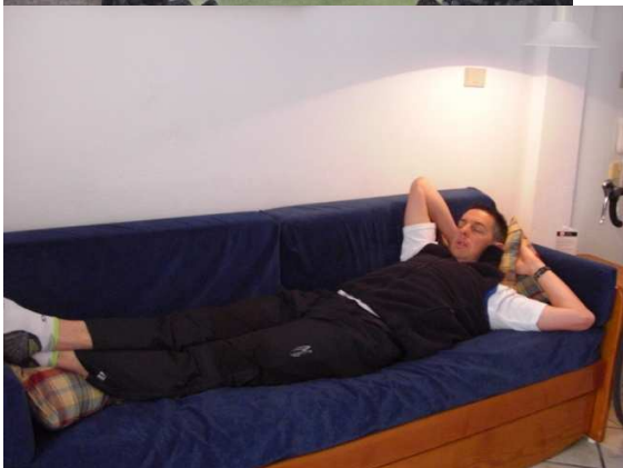
Crazy Golf took its toll on some though!!!!