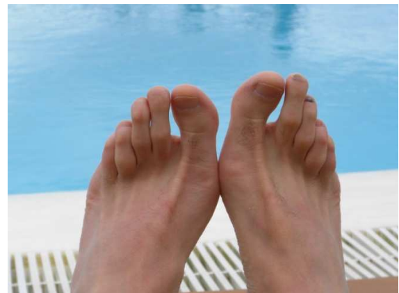
Guess who these belong to?????!