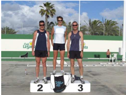
ExeterTri Club made their presence felt.

There was of course plenty of time to enjoy other facilities at the complex.