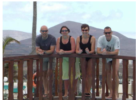
Relaxing by the leisure pool.